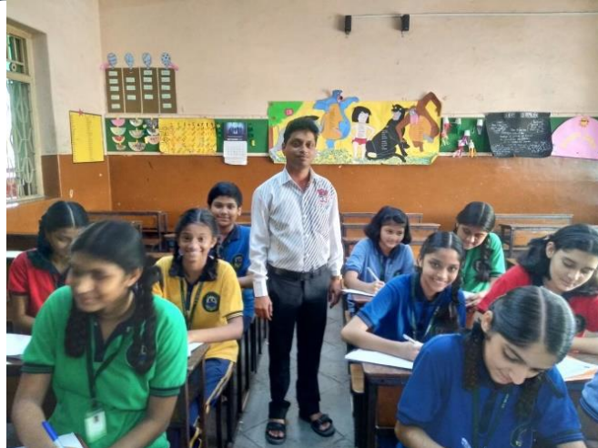
Alumni sponsored Intra-school Extempore Essay Competition