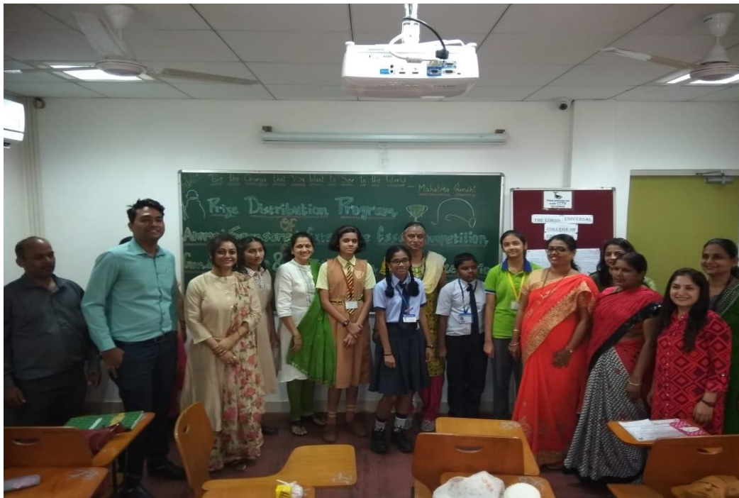
INTRA-SCHOOL ESSAY COMPETITION SPONSORED AND CONDUCTED BY LUCEAA CONDUCTED ON 'GANDHIJI'S BELIEF AND ITS RELEVANCE IN THE PRESENT SCENARIO'