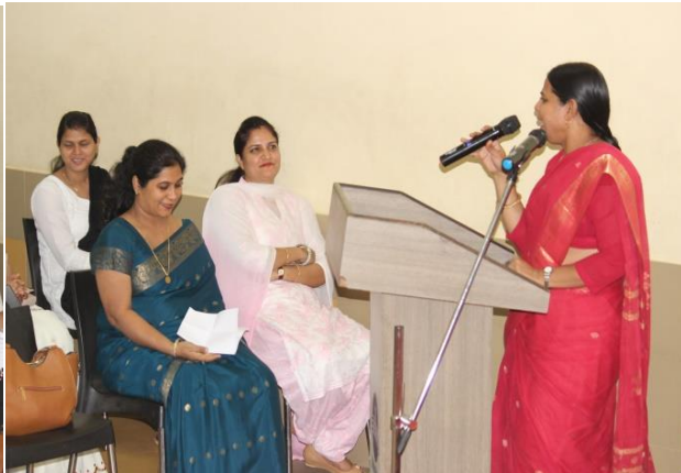
Degree Certificate Distribution Ceremony