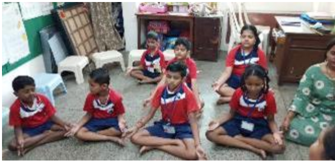
Nai talim based Lessons taken in school and distribution of cloths bags in community