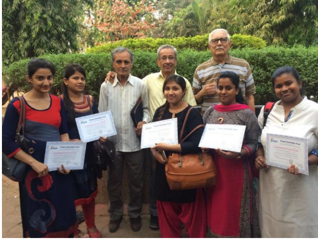
Children's Day celebration