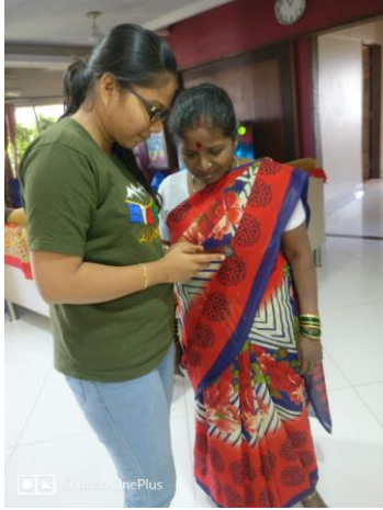
← Digital Training for online payment