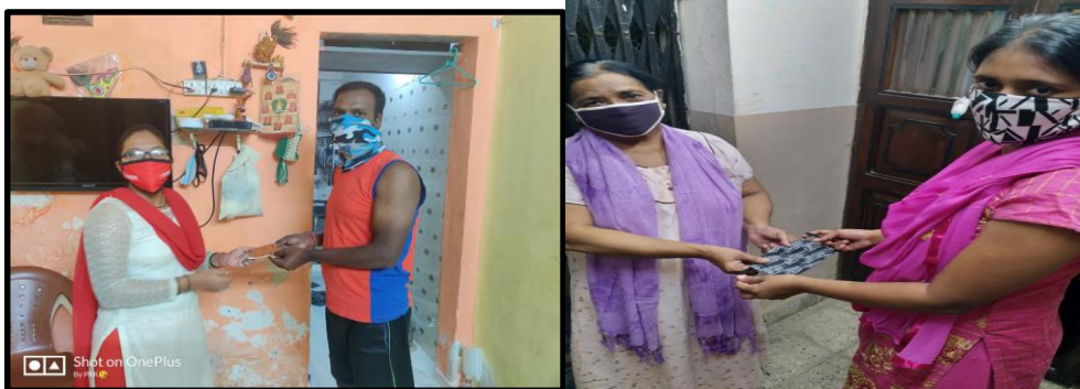
Hand made face mask and distribution in Community

S.Y. Students had conducted awareness programme on Corona virus amongst students and adults. This was taken under research and effectiveness of this programme was checked through pre-test and post-test.